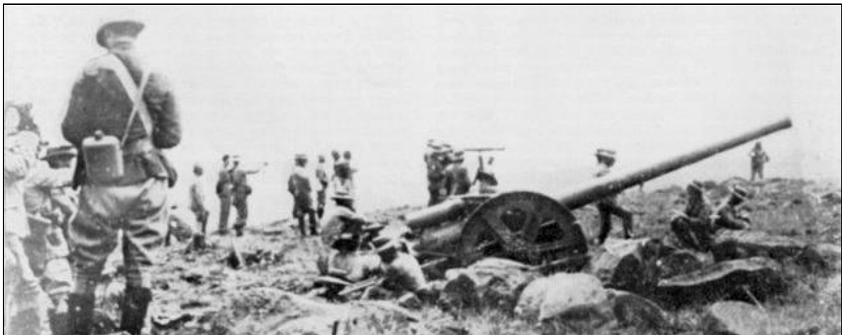
A 4.7 inch naval gun in action at Colenso

“Afraid of our naval guns! They have moved their own heavy pieces out of action!” was the general comment. The troops stepped forward with an eagerness of action after long restraint, and the proud smile of victory assured. No one supposed that the farmer foe would be mad enough to place their advance across the river which would cut off their retreat, to face advancing columns that must hurl them back into the water. Perhaps such tactics were the result of Boer over-confidence, but such over-confidence, if it invites disaster, sometimes achieves victory.