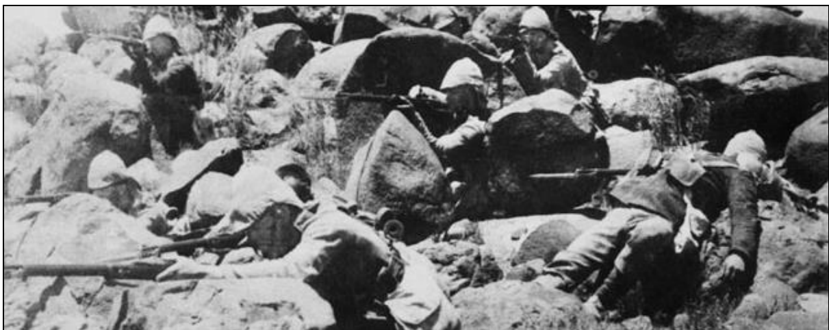
General Gatacre's forces trapped and under fire at Stormberg

Shot at every foot of the way and worn-out by twenty four hours of continuous exertion, the column slowly extricated itself, fighting as it retired to Molteno, harassed by bullet and shell into the very outskirts of the city. When roll was called six hundred men out of the small column failed to answer their names, either killed, wounded or prisoners. It is little credit to the Boers that General Gatacre was not overwhelmed. Far superior in number, they had the column in a trap which simple tactics could have closed. But the Boer's dislike of open fighting, even when great things might be accomplished thereby, enabled the British to execute their masterful retirement with three-fourths of their force intact.