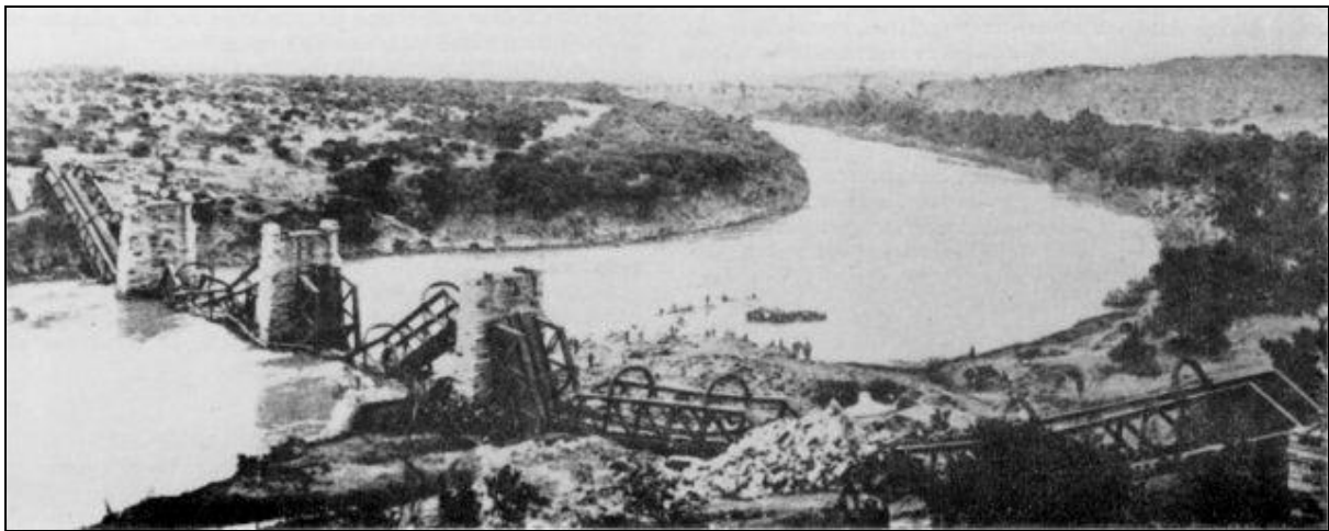
The railway bridge at Colenso tactically destroyed by the Boers

The Boers destroyed the massive railroad bridge at Colenso, but left the road bridge intact, occasionally sending patrols over as if they had retained it for their own use, and afterwards occupying the houses on the right bank to lure on the force. On their side of the river, Fort Wylie, evacuated by the British early in November, dominated the bridges. It was greatly strengthened by earthworks. The drifts or fords over the Tugela, marked on the field map, were cunningly altered by throwing dams across at night, rocks abounding for this purpose. Rows and rows of trenches were erected before these drifts, the defences being masked by brush and the natural rocks of the kopjes.